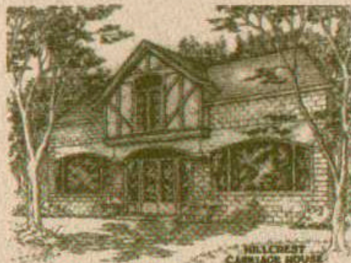
The Carriage House at Hillcrest

HILLCREST OFFERS THE GUEST WARMTH, SERENITY AND BEAUTY. AS YOU ENTER THE GATES TO HILLCREST YOU DRIVE BETWEEN THE ORIGINAL PILLARS. APPROACHING THE MAIN HOUSE WHERE THE MAGNIFICENT PANORAMIC VIEW UNFOLDS BEFORE YOU. THE BREATHTAKING SCENE OF RIVERS AND LAKES WITH FLOWER GARDENS EVERYWHERE MEANS.... YOU HAVE ARRIVED.